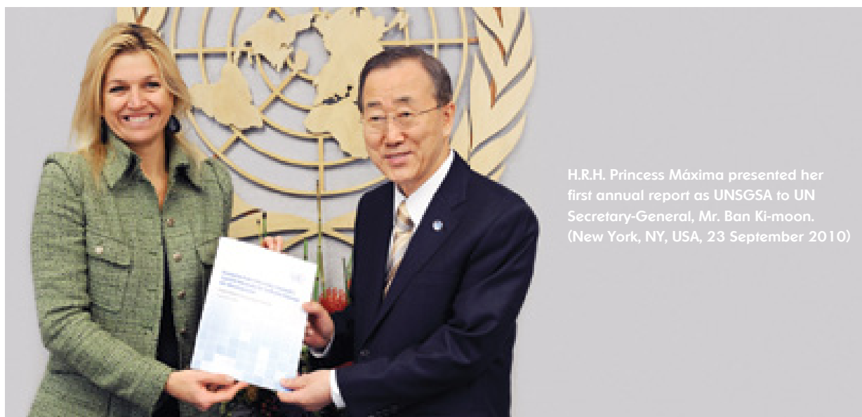
H.R.H. Princess Máxima presented her first annual report as UNSGSA to UN Secretary-General, Mr. Ban Ki-moon. (New York, NY, USA, 23 September 2010)

For more on the role of the UNSGSA, please see Annex A or visit www.unsgsa.org .