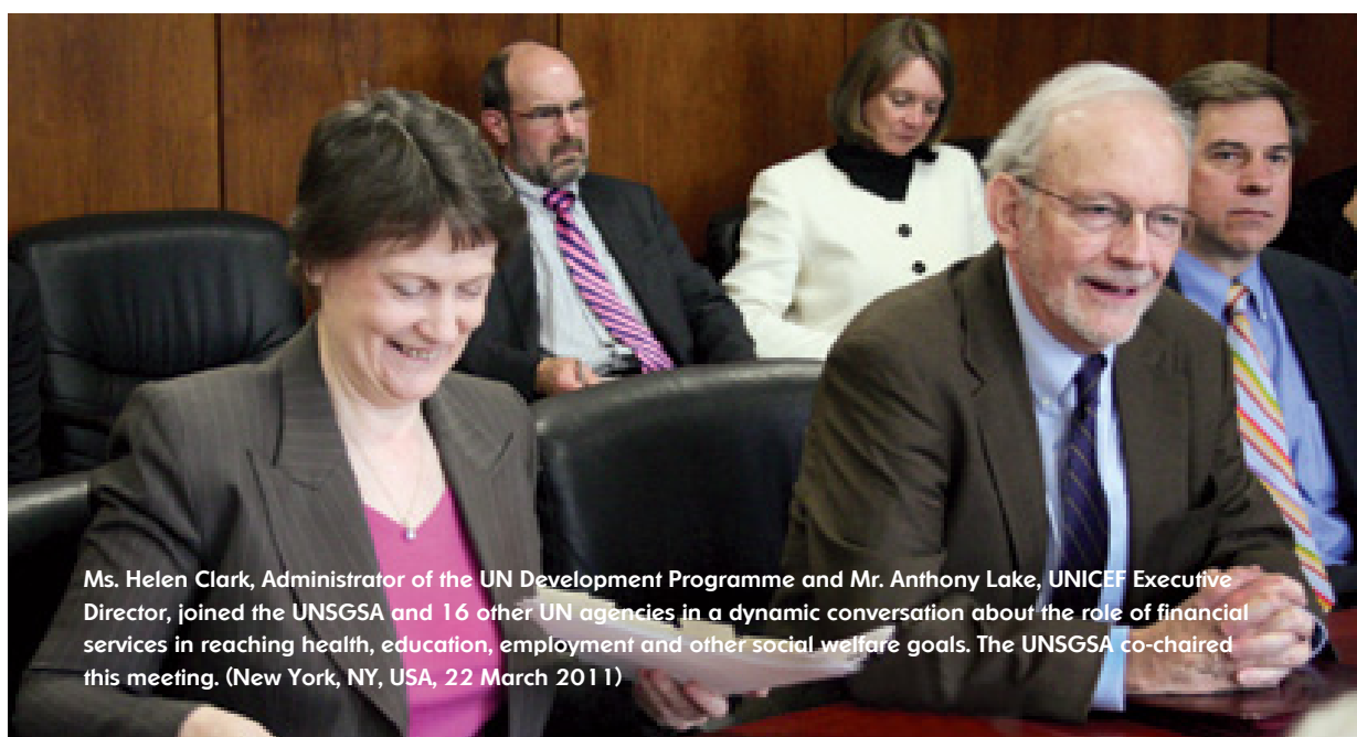
Ms. Helen Clark, Administrator of the UN Development Programme and Mr. Anthony Lake, UNICEF Executive Director, joined the UNSGSA and 16 other UN agencies in a dynamic conversation about the role of financial services in reaching health, education, employment and other social welfare goals. The UNSGSA co-chaired this meeting. (New York, NY, USA, 22 March 2011)

In the road ahead, the UNSGSA will continue to seek opportunities to increase synergies and coherence across the UN system and multilateral initiatives. She will help to lead global advocacy efforts through her UN designation and her role as Honorary Patron of the G20 Global Partnership for Financial Inclusion. She will also encourage national government leadership in developing sound and effective policies, including by monitoring financial inclusion with robust data. Ultimately, the UNSGSA seeks financial systems that are strong and accessible to all.