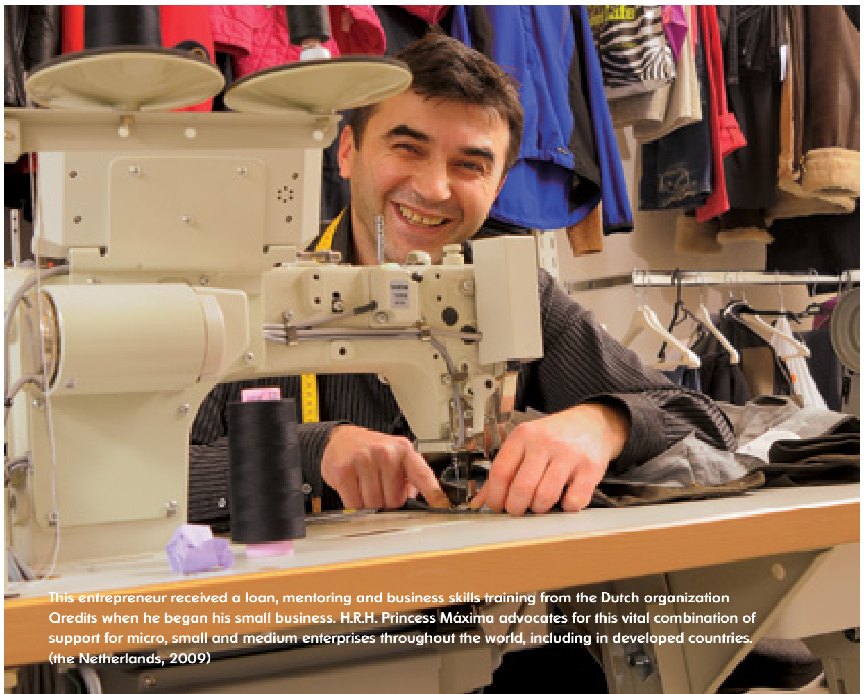
This entrepreneur received a loan, mentoring and business skills training from the Dutch organization Credits when he began his small business. H.R.H. Princess Máxima advocates for this vital combination of support for micro, small and medium enterprises throughout the world, including in developed countries. (the Netherlands, 2009)