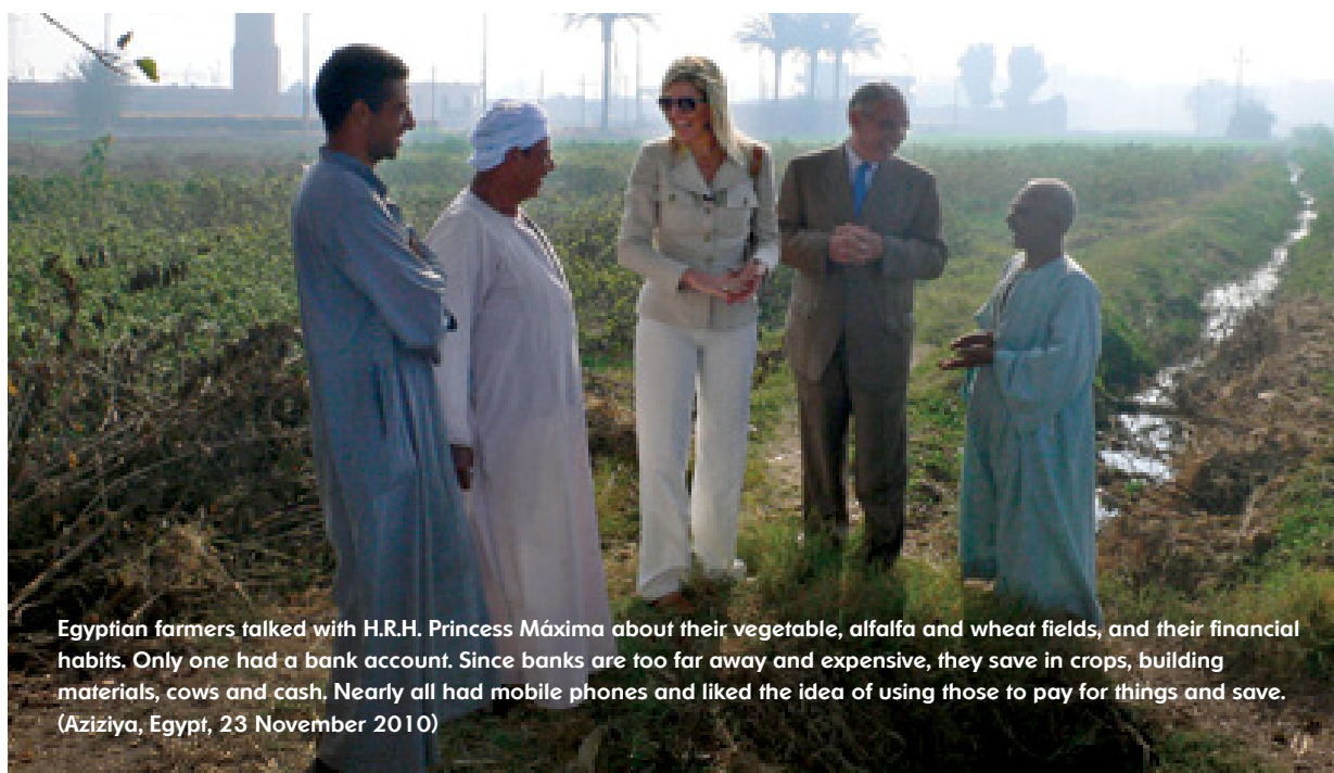
Egyptian farmers talked with H.R.H. Princess Máxima about their vegetable, alfalfa and wheat fields, and their financial habits. Only one had a bank account. Since banks are too far away and expensive, they save in crops, building materials, cows and cash. Nearly all had mobile phones and liked the idea of using those to pay for things and save. (Aziziya, Egypt, 23 November 2010)

Ultimately, the UNSGSA believes that better and more extensive data, research and analysis will enable smarter investments and promote more effective policy responses. Global Standard Setting Bodies, for example, are particularly interested in data to examine the impact of regulatory changes and analysis of qualitative factors such as gender, socioeconomic characteristics, financial literacy and consumer protection. As conversations continue, the UNSGSA will continue to share the need for studies on particular issues, including impact, with research and implementing partners to call attention to key findings and, encourage data-based decision making.