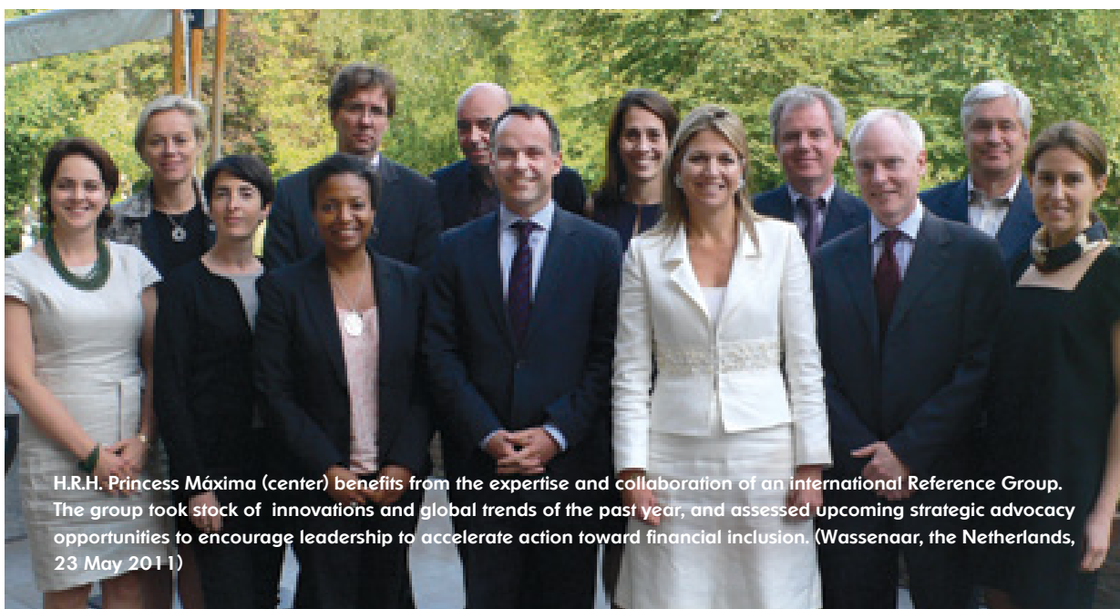
H.R.H. Princess Máxima (center) benefits from the expertise and collaboration of an international Reference Group. The group took stock of innovations and global trends of the past year, and assessed upcoming strategic advocacy opportunities to encourage leadership to accelerate action toward financial inclusion. (Wassenaar, the Netherlands, 23 May 2011)

A small Office of the UNSGSA, housed at UNCDF in New York, works closely with the Secretariat of H.R.H. Princess Máxima in The Hague to coordinate her UN activities in the field of inclusive finance. The Office receives generous financial support from the Bill & Melinda Gates Foundation.