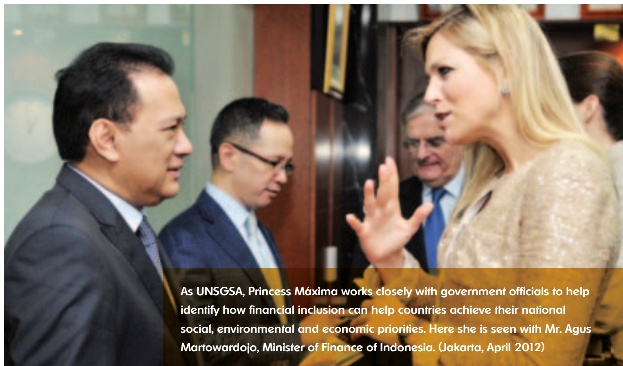
As UNSGSA, Princess Máxima works closely with government officials to help identify how financial inclusion can help countries achieve their national social, environmental and economic priorities. Here she is seen with Mr. Agus Martowardojo, Minister of Finance of Indonesia. (Jakarta, April 2012)

The UNSGSA is grateful to all of her partners for their insights and collaboration.